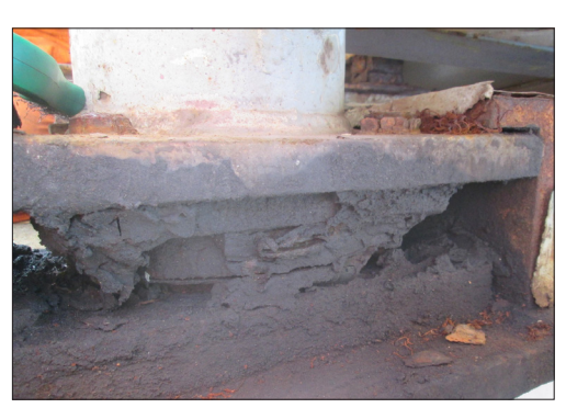
Existing bearing prior to removal shows excessive corrosion

The existing bearings all appeared to be original PSC inverted mechanical pot bearings that had been supplied circa 1983. The findings revealed these bearings had reached the end of their design life and needed to be replaced. Excessive corrosion and debris to bearing fixings, uplift brackets and adjacent steelwork had caused stress on the bearings, which subsequently resulted in skew, between bridge and jacket structures inhibiting movement.