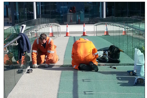
Footbridge deck - joint fitted into position

The Coventry Arc is an aesthetically pleasing footbridge, and even more so at night when the fitted LED lights on the hand rails are lit against the contrast of the lake below.