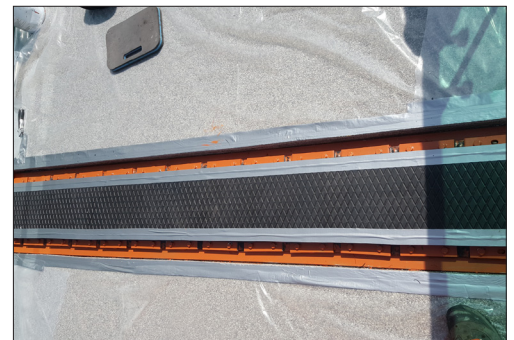
T-Mat joint installed and prepared for application of nosing mortar