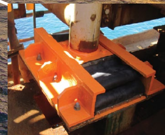
Link Bridge Bearings Pages 4-16