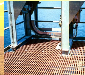
Link Bridge and Walkway Grating Pages 17-24