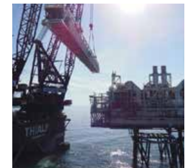
OFFSHORE LINK BRIDGE BEARING INSPECTIONS