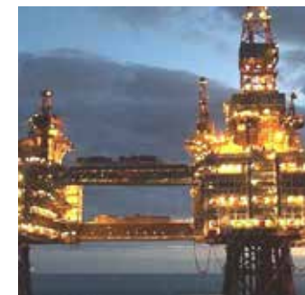
SCOTT PLATFORM LINK BRIDGE