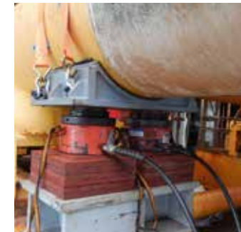
BRIDGE JACKING & BEARING REPLACEMENT

USL Ekspan provide full turnkey solutions – for supply, installation and maintenance of bearings on link bridges, which connect and carry services between platforms. USL Ekspan have highly skilled and fully trained offshore engineers who regularly visit installations to maintain sliding bearings.