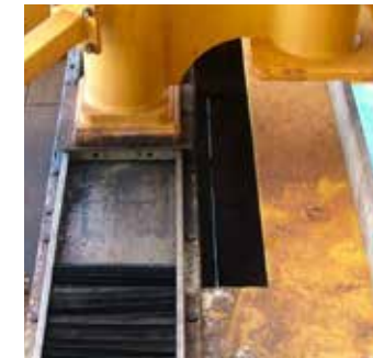
BRIDGE BEARING INSPECTION