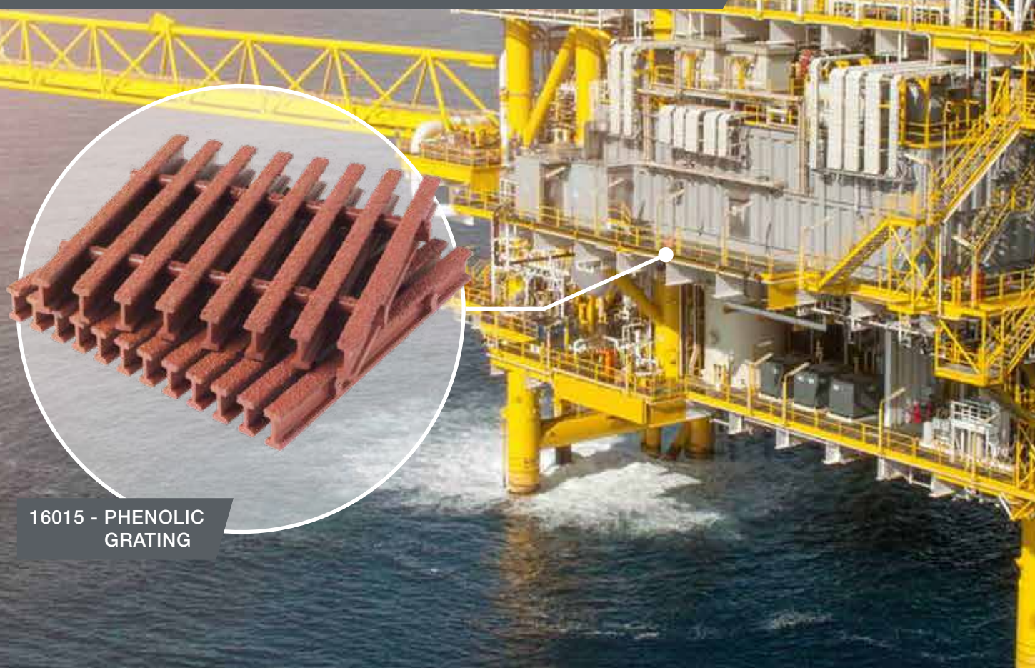
16015 - PHENOLIC GRATING