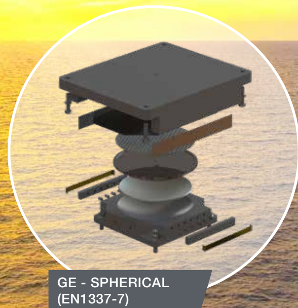
GE - SPHERICAL (EN1337-7)